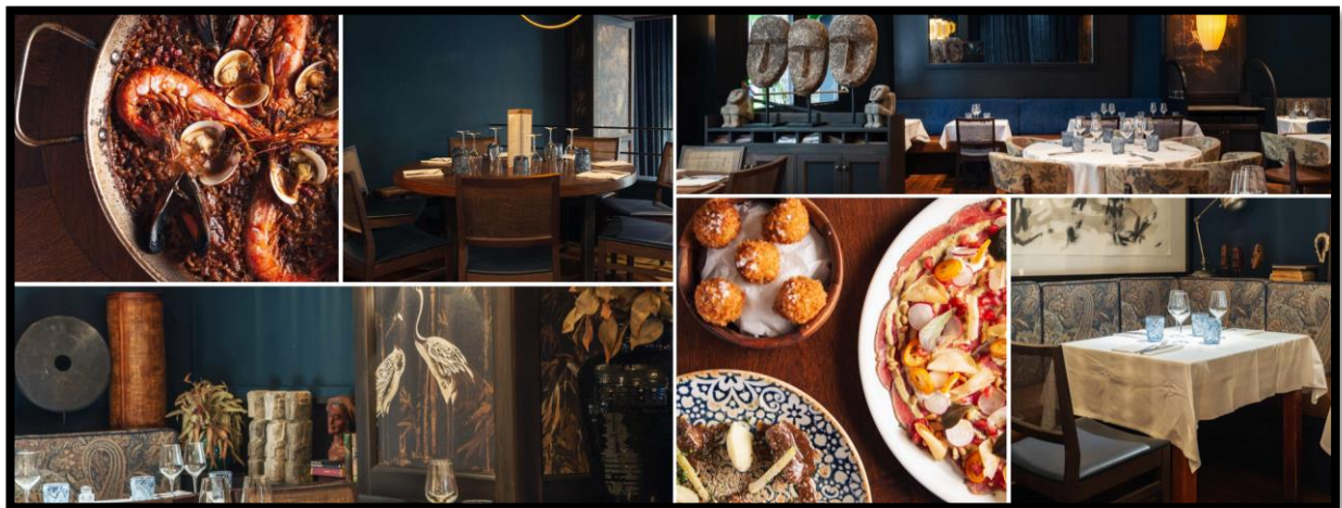
La Dolça Herminia Restaurant