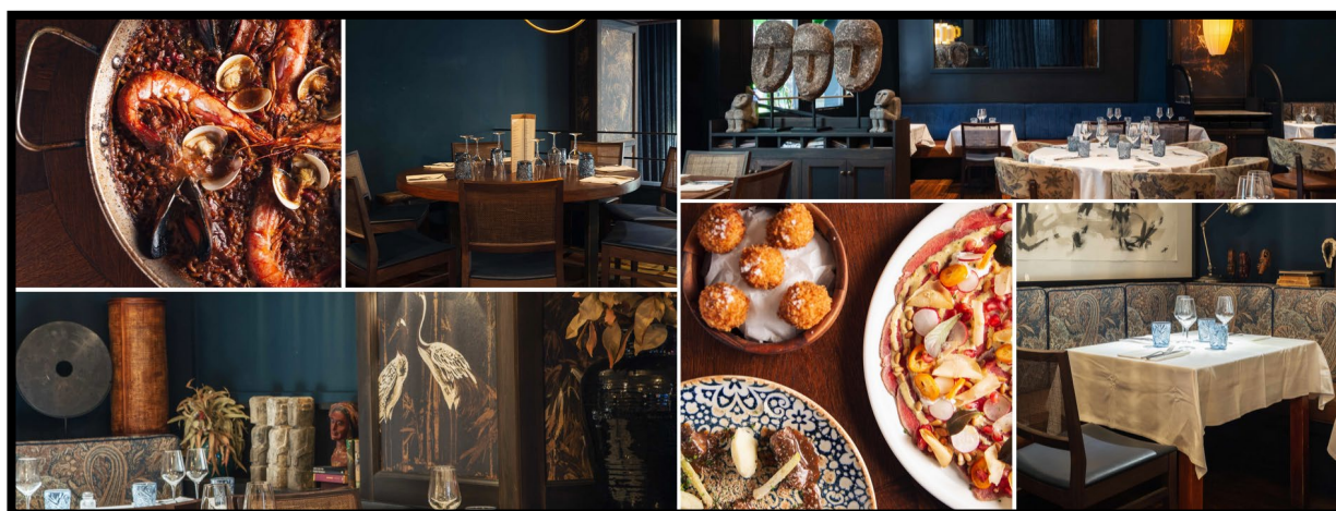
La Dolça Herminia Restaurant